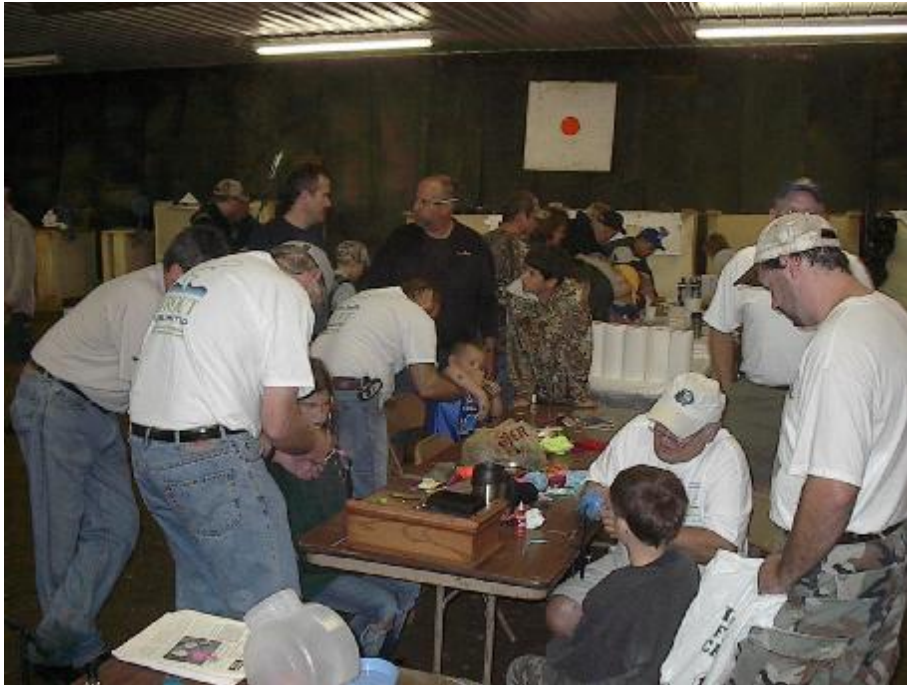
This is backbreaking work, as evidenced by these hardworking Vanguard volunteers helping kids tie flies during Heritage Days.

LENOX TOWNSHIP—There was a steady stream of kids the entire day at this year’s Heritage Days that kept five Vanguard Chapter volunteers busy showing them how to tie their first Woolly Bugger. As has been the case in the past, the kids were highly enthusiastic about learning all they could about outdoor sporting activities such as fishing, hunting, and archery.