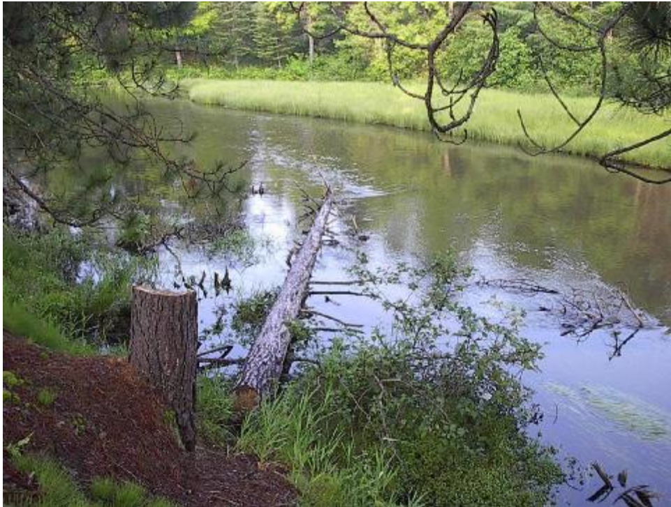
The Hexes slept while Vanguard members wept during the Chapter Outing on the Manistee River.

It wasn't to be. At night temperatures dropped into the 30's, enough to frost the bippy of any Hex brave enough to peek his head above the silt bed. Rain didn't help either. Although the waters of the