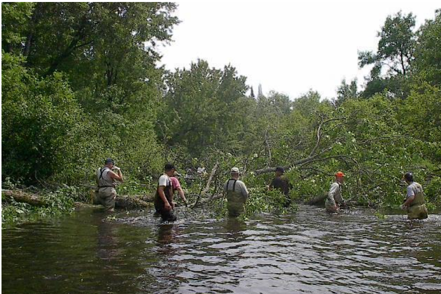
Vanguard volunteers work on moving and securing a downed tree into position during the work weekend on the Black River. More than a dozen trees were placed in the river during the endeavor to provide habitat and improve stream flow.

The crews accomplished almost twice as much as the year before in less time. By 3 p.m., the crews had completed the last site scouted for this year's project, downed a couple beers in celebration, and were headed for Crockett Rapids and the take out point ahead of a threatening thunderstorm.