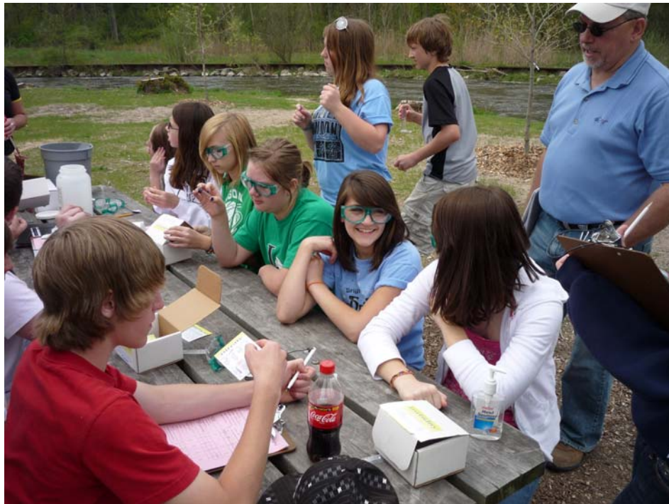
Students from Waldon Middle School do chemical testing of the Clinton River.

LAKE ORION—This is the fifth year that Waldon Middle School in Lake Orion has participated in the Clinton River Watershed Council's Stream Monitoring Day. Students from all over the southeast Michigan area, in the Clinton river watershed, participate in the stream monitoring program each year, collecting important data on the health of the watershed. This year over 30 area schools participated