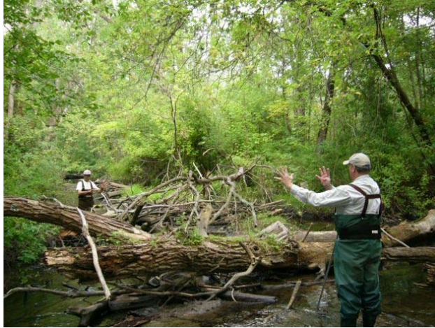
Mark and Ron Zeilinger negotiating the fallen debris in Paint Creek. Some work to be done.

Water temperature monitoring is still going on during the summer providing most valuable information on the water condition.