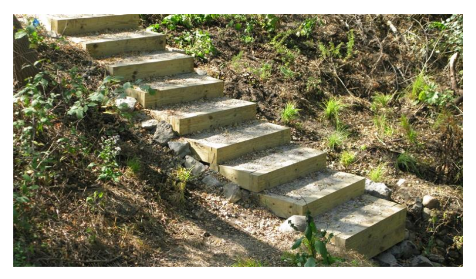
New stairway and native plantings completed by Vanguard Chapter members.

In late May and early June of last year, the materials were purchased and the individual steps were constructed at a member's home. They consisted of pressure-treated timbers cut and spiked together to form rectangular frames.