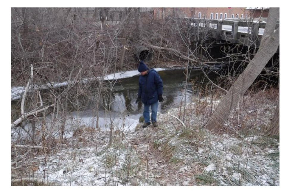
Old pathway down the bank to Paint Creek before stairway access project.