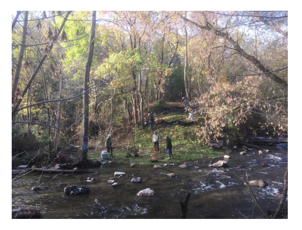
The Kern Road planting site.