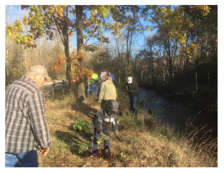
Tree planting activities along Paint Creek at Silverbell Road.

The final location was at Ludlow Rd. in the City of Rochester. CVTU has been working at this site for several years to repair the damage that was done when a large mound of dirt was left behind after the installation of an angler access.