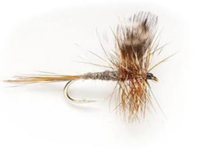
Above: Adams fly pattern and mayfly counterpart.

river, up and downstream, as well as the connections that exist between the stream and surrounding landscape are vast. Streams and terrestrial areas adjacent to them, often called riparian zones, are closely linked by the exchange of organic and inorganic materials such as leaves, wood, sediment, nutrients, and organisms.